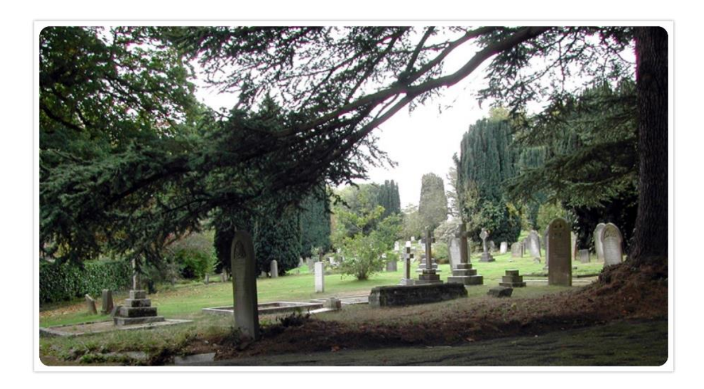
Forest Row cemetery

http://www.ashdownforest.org/enjoy/history/AshdownResearchGroup.php